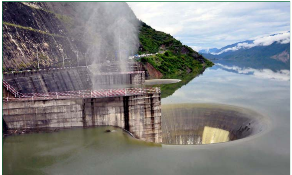
Tehri Right Bank Shaft Spillway (Morning Glory) in operation evacuating floods above the Full Reservoir Level