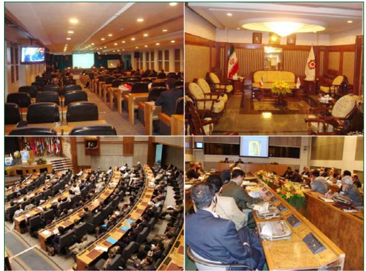
The Congresses and various meetings will be held in the magnificent, modern and fully equipped venue in Tehran. The venue has glorious halls, modern audio – visual equipments, and simultaneous translation facility. The entire organization of the event is handled by a high level internationally experienced organizer.

The Executive Board has facilitated issuing visas with the cooperation of Ministry of Foreign Affairs (MFA). The participants are requested to fill the registration form and visa application form by accessing the Congress website. We encourage delegates