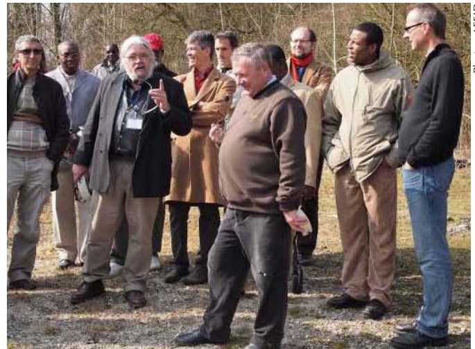
Delegates at the field visit organized by the agricultural chambers of the Beauce region

quantitative status" is clearly defined in the WFD, this is not the case for the complex "good chemical status." So the lessons learned in the last 10 years were presented.