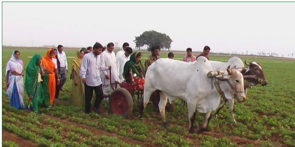
Women empowerment in a watershed, Andhra Pradesh, India

Large yield gaps with farmers' yields being about 2 to 4 times lower than the achievable yields for major rainfed crops are observed in Asia, Africa and CWANA (Central and West Asia and North Africa) regions. There is an urgent need to develop a new paradigm for upgrading rainfed agriculture and the business as usual approach can no longer achieve the goal of food security. Vast scope exists to unlock the potential of rainfed agriculture through sustainable management of natural resources through integrated watershed management (IWM) approach. The IWM approach provides a framework for