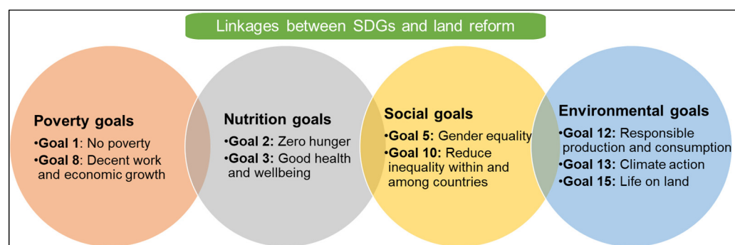
Figure 3. Categorized Sustainable Development Goals directly linked to land reform.

As already alluded to, a sustainable land reform promotes social justice, economic development, and environmental protection, the three pillars that anchor sustainable development. Thus, a sustainable land reform policy is directly linked to SDGs (Figure 3) as it reduces rural poverty by raising land productivity, improves rural livelihoods, creates employment, and enhances environmental quality. These land reform outcomes are amplified by synergistic effects in the urban economy [41]. Therefore, a land reform policy is a catalyst for achieving SDGs.